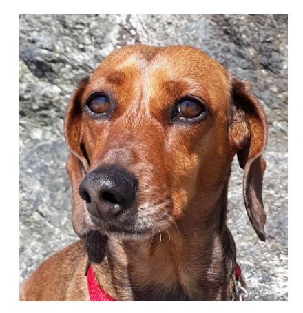
Good shot but notice nose slightly misplaced. ×