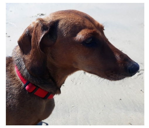
Back lit. Make sure dog is looking into the sun.×

To get the best results take LOTS of photographs. Look at the following examples for tips. A good phone camera is fine.