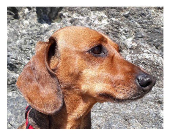
Lovely photo of a side profile. Do you want the dog's collar in the painting?