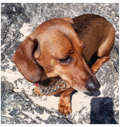
Beware of standing above the dog, take almost lying down. ×