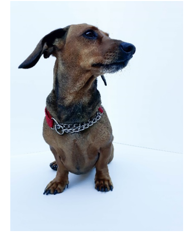
Find a simple background, Photograph can be cropped for just the face. ✓