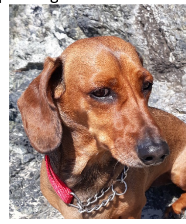
Quite good, but still looking from above, which gives distortion, such as a longer nose. ×