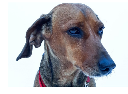
A ¾ pose looks great. Bring camera to eye level. ✓